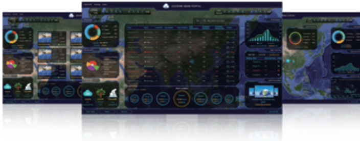
The live and archived data from any PV power plants in a particular account can be called up and graphically displayed.