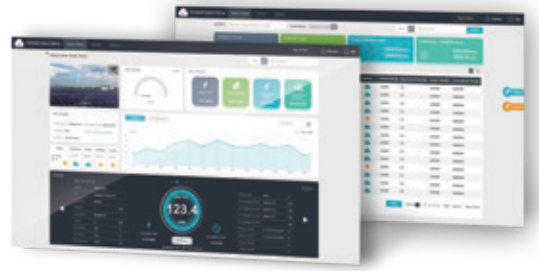
Dynamic carousel of all the plants under your account